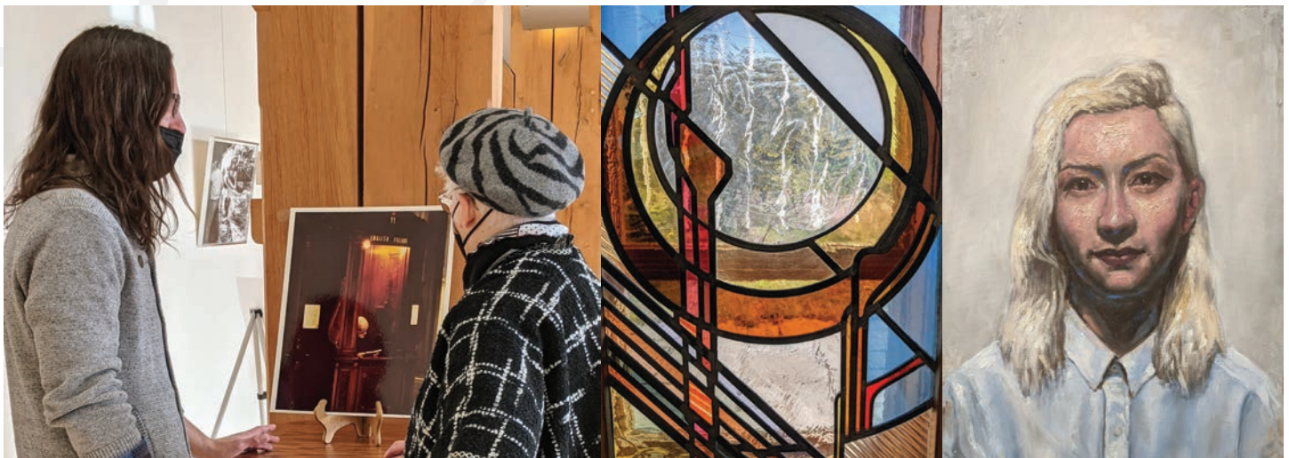
Photography Collection from Ralph Cowan gifted by wife Pat Cowan